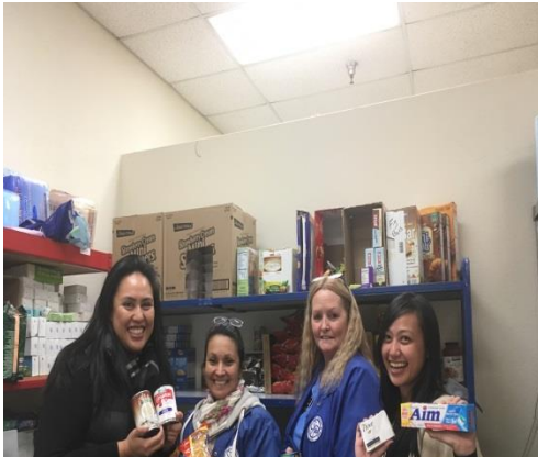
Staff members in the now brightly lit canned goods storeroom